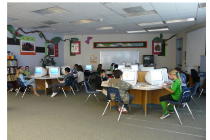
Quail Summit's current computer lab

The Move "IT" Campaign is coming soon! All money raised will go toward technology needs at Quail Summit. Our goal is to raise enough money to purchase new computers for the schools computer lab. We would also like to upgrade the labs existing computers and move them into our classrooms. As you can imagine this will take well over $26,000. This is no small task, but with your support our students will succeed! Children are our future and technology is the key to open endless possibilities in the future. All students at Quail Summit thrive and learn while using the computers; let's raise enough money to make it the state-of-the-art place they deserve! The kids will be collecting money between April 14 and April 25. Look for more information in your child's backpack on April 14, 2008. THANK YOU FOR YOUR SUPPORT!